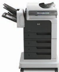
HP LaserJet Enterprise M4555fsm MFP