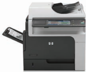
HP LaserJet Enterprise M4555h MFP