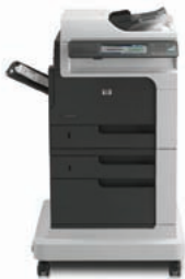
HP LaserJet Enterprise M4555f MFP